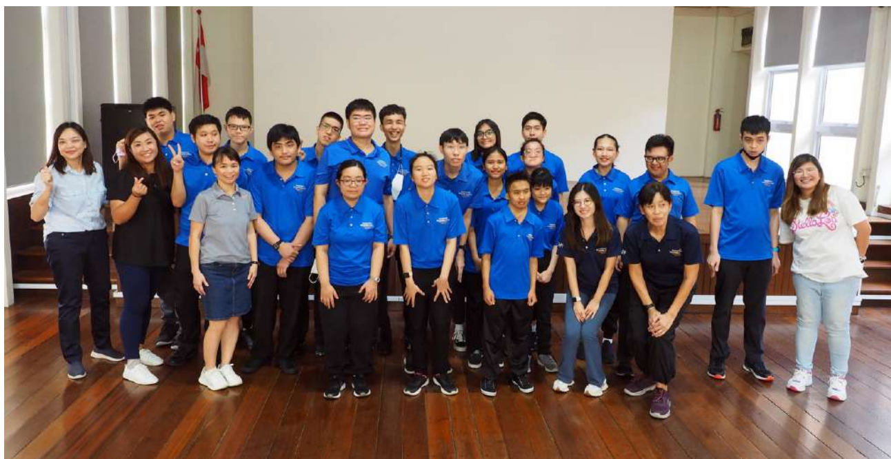
The Class of 2023 with teachers and staff