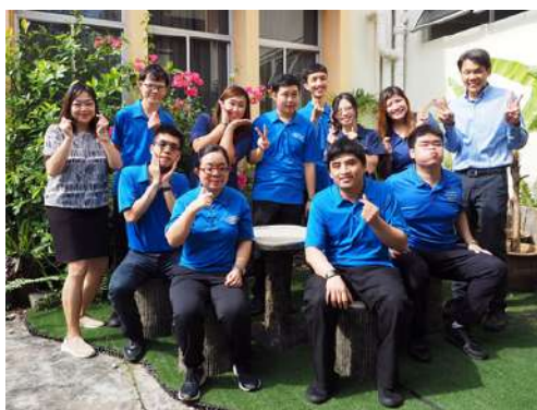
Housekeeping Operations Graduates

In November 2023, we bid farewell to a group of students who finished their training in F&B Services, Housekeeping Operations, and Food Preparation at MVS. Their time with us has ended, but it's the start of a new part of their lives. We wish them the very best, and we'd love to hear from them in the future to know how they're doing.