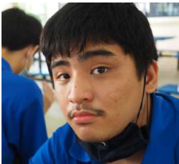
Hamizan Housekeeping Operations