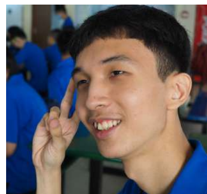
Soomin Housekeeping Operations