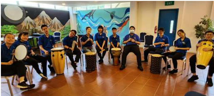
Students getting ready for the Drumming sessions

These programs reflect our commitment to diverse opportunities, with the Drumming Workshop emphasizing life skills through artistic expression and the IOS Device Accessibility Workshop equipping students with essential digital skills. We celebrate the success of these initiatives and eagerly anticipate further efforts in fostering a well-rounded and empowered student community.