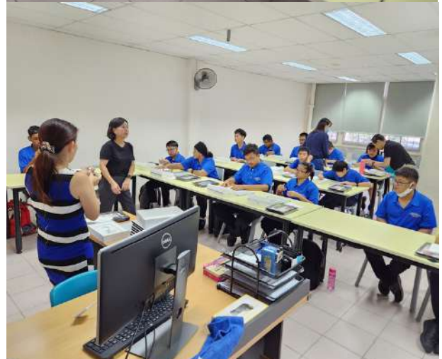
Students at the IOS Device Accessibility Workshop