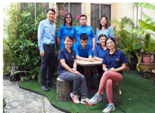
Food Preparation Graduates