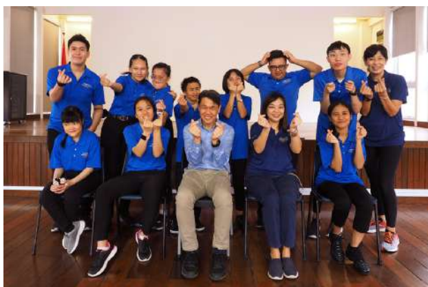
F&B Service Graduates